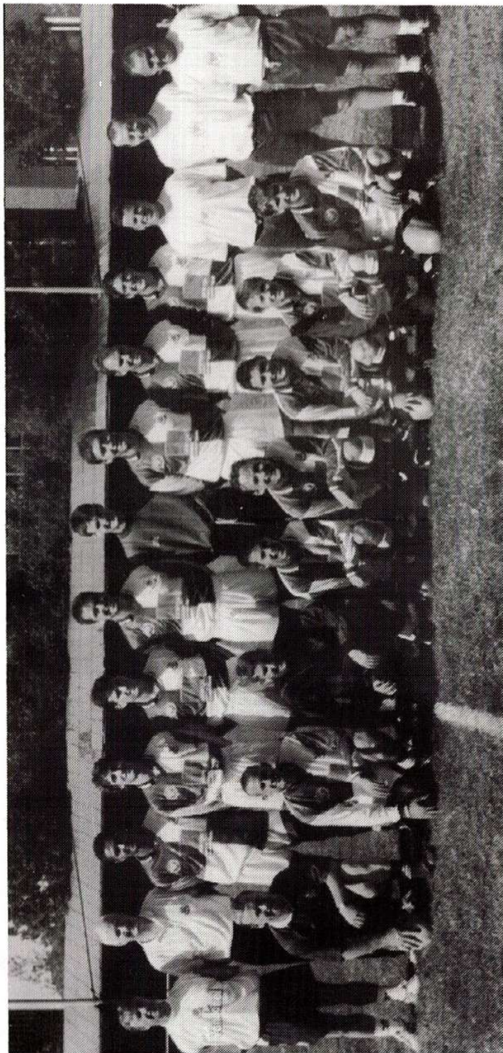
Wealdstone Football Club 1996/97